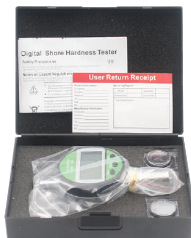
Completed set of Shore