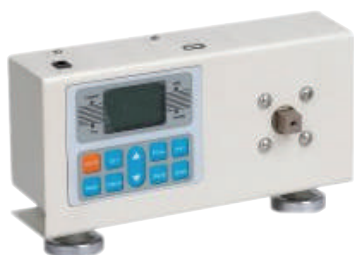
ET-1~ 20 without printer