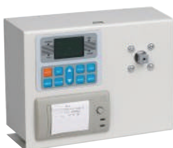
ET-1P~ 20P with printer